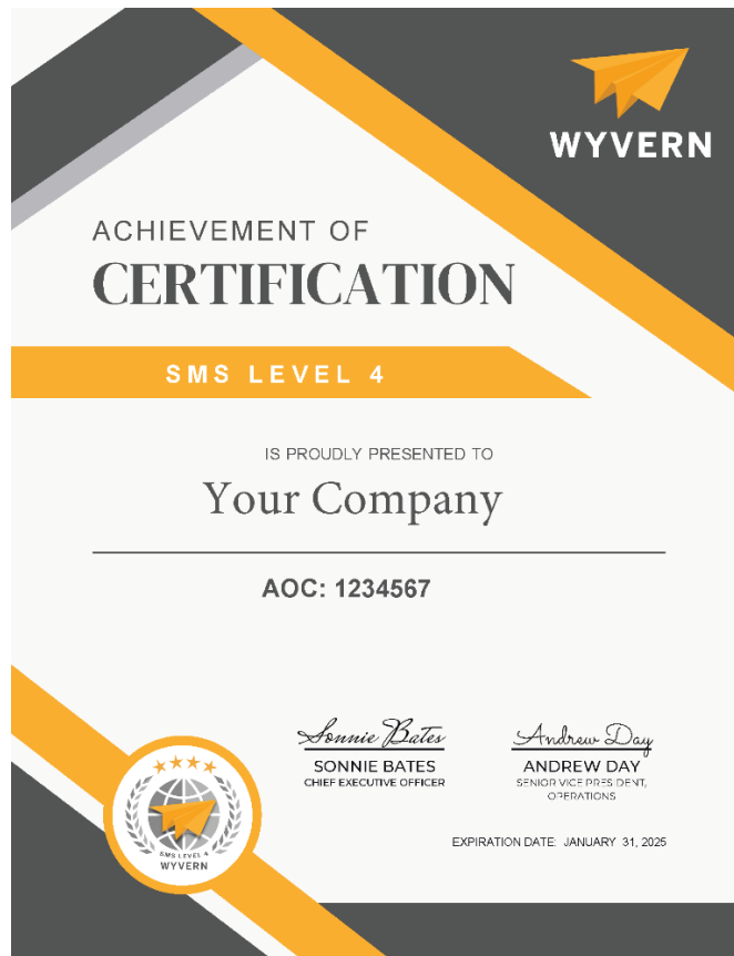
Figure 2. SMS Certification