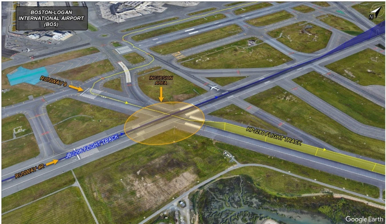
Figure 1. Flight tracks of both JetBlue (JBU206) and Hop-a-Jet (HPJ280) with yellow circle indicating incursion area.