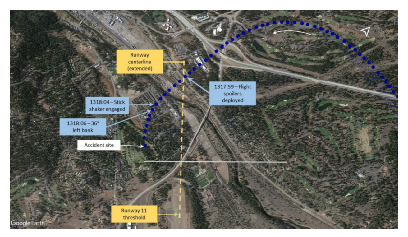
Figure 3. Accident airplane's flightpath during final approach after crossing the runway centerline.

Surveillance video from a business located along the airport perimeter captured the airplane in its final moments. At 1318:09 (according to the time captured by the recording device), the airplane was in a descending left turn on a southeasterly heading at a low altitude. About 1318:12, it entered a rapid left roll and disappeared below the tree line, and smoke appeared in the same location 5 seconds later.