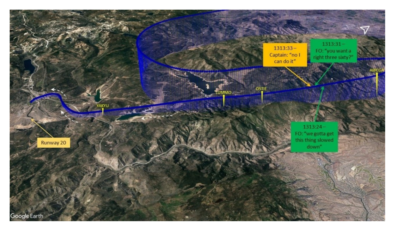
Figure 1. Airplane flightpath and crew discussion on runway 20 approach

At 1313:41 the captain instructed the FO, "Now just below two fifty give me flaps twenty please"; however, the FO responded, "Below two-fifty? how about below two-thirty?" (consistent with the published flap speeds of 231 kts in the manufacturer's operating manual that were also placarded in the airplane), and the captain agreed. The FO then stated again that they should start slowing down the airplane. A few seconds later, the controller terminated radar services and asked the flight crew to contact Truckee tower. At 1314:15, when the airspeed was about 228 kts, the captain again asked the FO to deploy flaps 20°, which the FO stated had been selected (and FDR data showed the flaps setting was selected 4 seconds later).